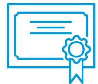
Certificates & Reporting